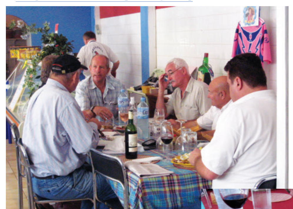
Boucherie René regulars enjoying lunch. Perfectly prepared meat accompanied by the tasty potatoes and fresh salad, right

that cute little curl under "ç"has brought çountless soupçons of disappointment.