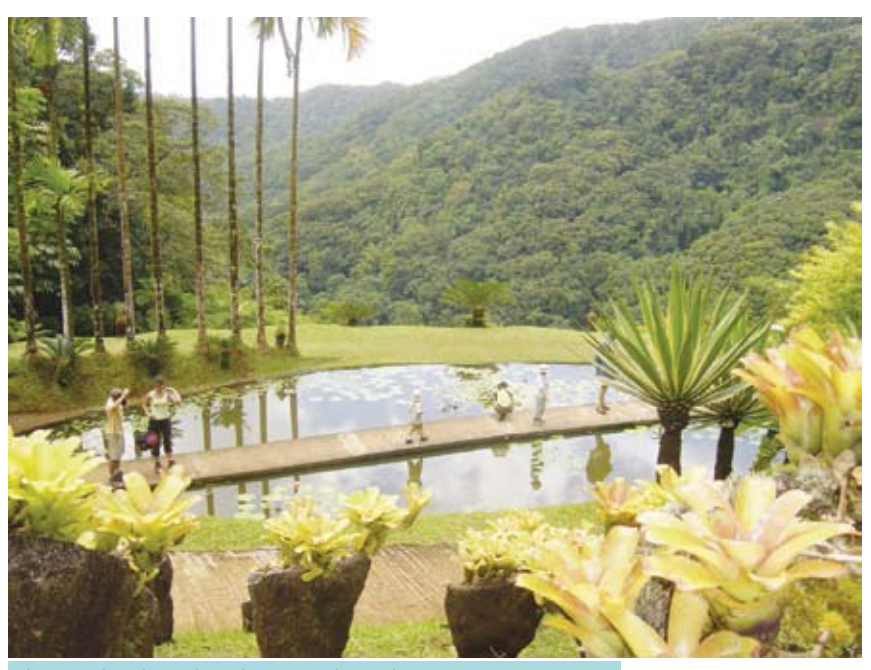
The Jardin de Balata botanical gardens—a Martinique must-see. The colorful Le St. Pierre market, opposite

Pelée is an innocuous looking crumple of green; its peak nuzzles the whipped-creamy clouds so innocently it's hard to imagine 1902, when its fiery black breath destroyed the entire town and 30,000 people.