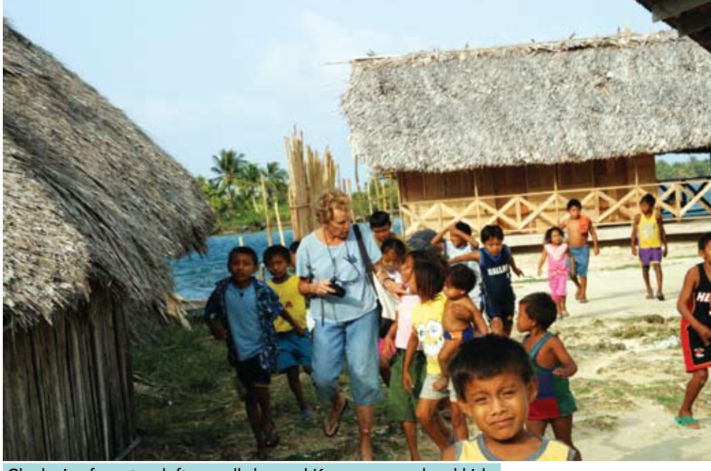
Clockwise from top left: a well-dressed Kuna woman; local kids following the pied-piperish author; molas, molas, everywhere!

But civilization, in the form of ever-increasing cruising boats and tourism—coupled with the mola's near-universal appeal—has trans-